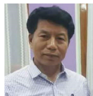
By: N. Munal Meitei

"Environmental pollution is an incurable disease. It can only be prevented." -Barry Commoner.