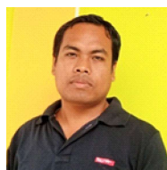
By: Jayanta Sharangthem

India has a federal structure of governments with powers divided between the centre and the states. Each has its own jurisdiction. But we, the people of India, frequently notice that every government that comes to power uses the government institutions and organs as per its wishes so that the government gets some profit from them. Now, there is no balancing between the executive, the judiciary, and the legislature. The legislature is dominating the two. The central government has recently brought the National Judicial Appointment Commission (NJAC) so that the centre can have a firm hand in controlling the judicial system. The government is trying to control the national media, including social media. Anchor Ravish Kumar has resigned from NDTV after the news channel was acquired by the Adani Group. The majority of national news channels broadcast irrelevant news in order to divert people's attention away from national issues such as unemployment, economic slowdown, hunger index, rupees slowing against the dollar, and so on. These days, there are so many paid and sponsored news channels and social media groups supporting government agendas.