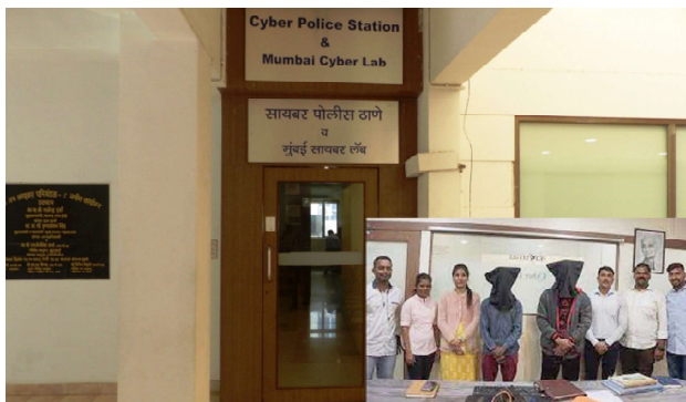
Two of the four accused arrested in connection with job racket by Mumbai Police.