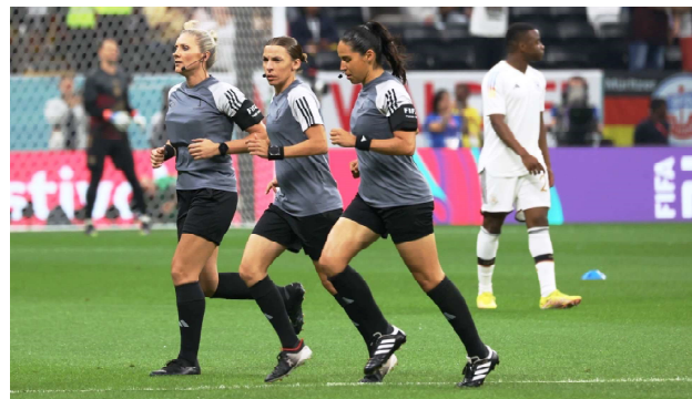
The first female-led trio to officiate a men's match in a FIFA World Cup takes to the field

The final whistle sent Morocco players storming out on the pitch to celebrate, as their